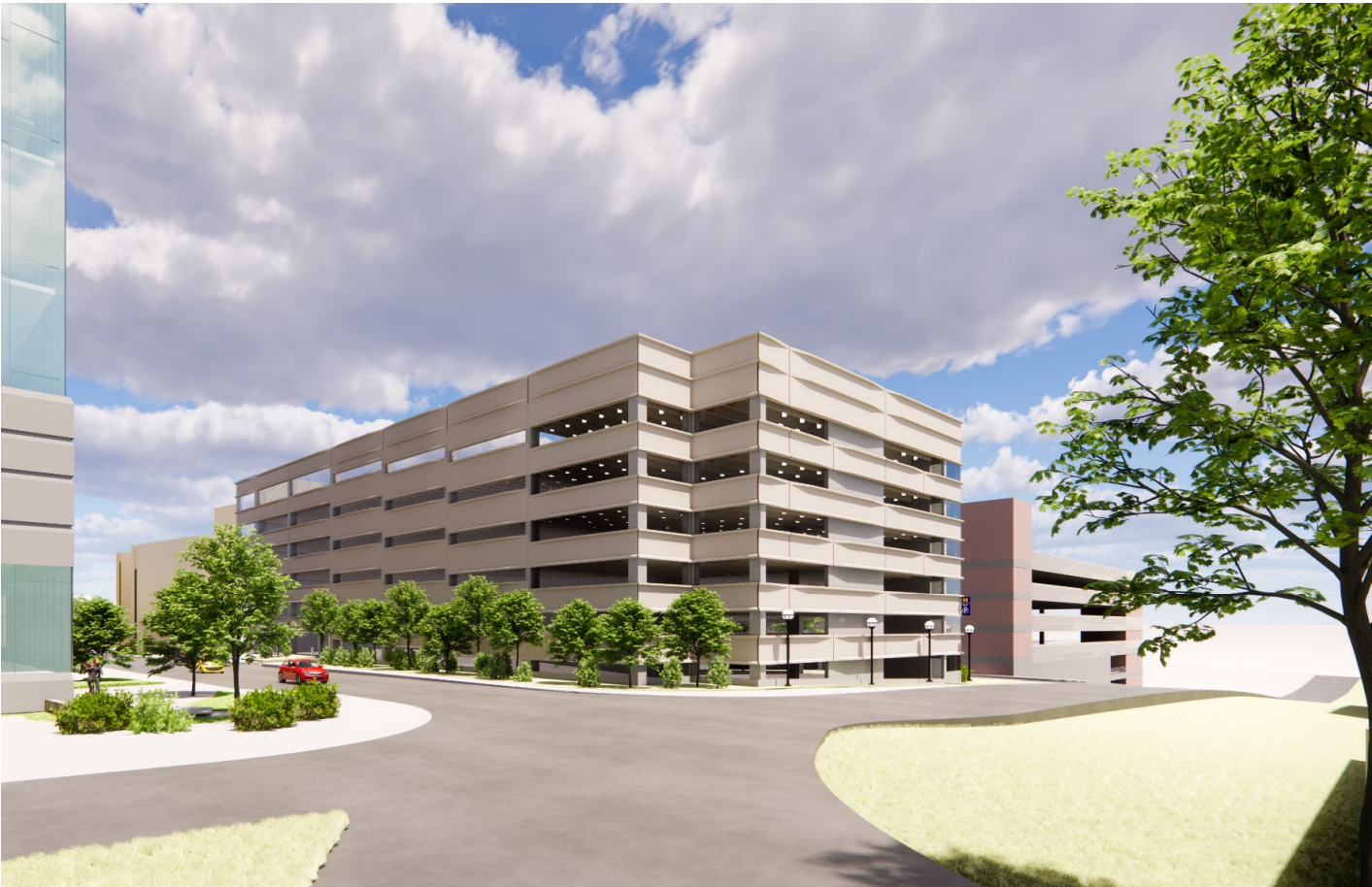
View from corner of Catherine and Zina