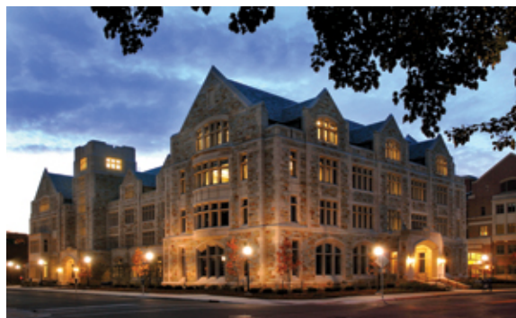
University of Michigan Law School, South Hall

In recent years, there have been significant fundraising efforts for new construction and expansion of the Law School, most recently resulting in the new South Hall academic building (see Law School South Hall and Robert B. Aikens Commons Construction Audit Report dated September 27, 2012). Gift and gift-in-kind donations are handled by the Law School's Office of Development and Alumni Relations. Private donations aid student support, faculty research, and other programmatic areas. The Office of Development also coordinates reunion weekends and various Law School community events throughout the year.